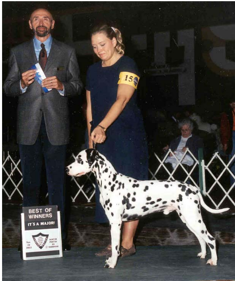
CH Vinland’s Archangel O’ Radagast (CH Firesprite Starcrest Vinland(L) x CH Radagast Vinland Gardn O’ Eden)

Our first homebred champion- finished exclusively from Bred by. GOOD BOY GABE!