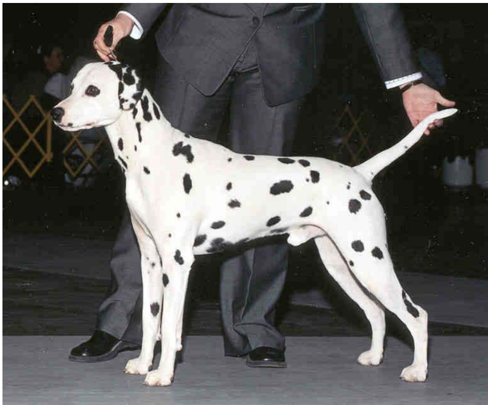
(CH FIREWAGN’S POKE O’DOT OF CHAUCER x CHAUCER’N’DAPPERS DOTTAWAY DARCY)