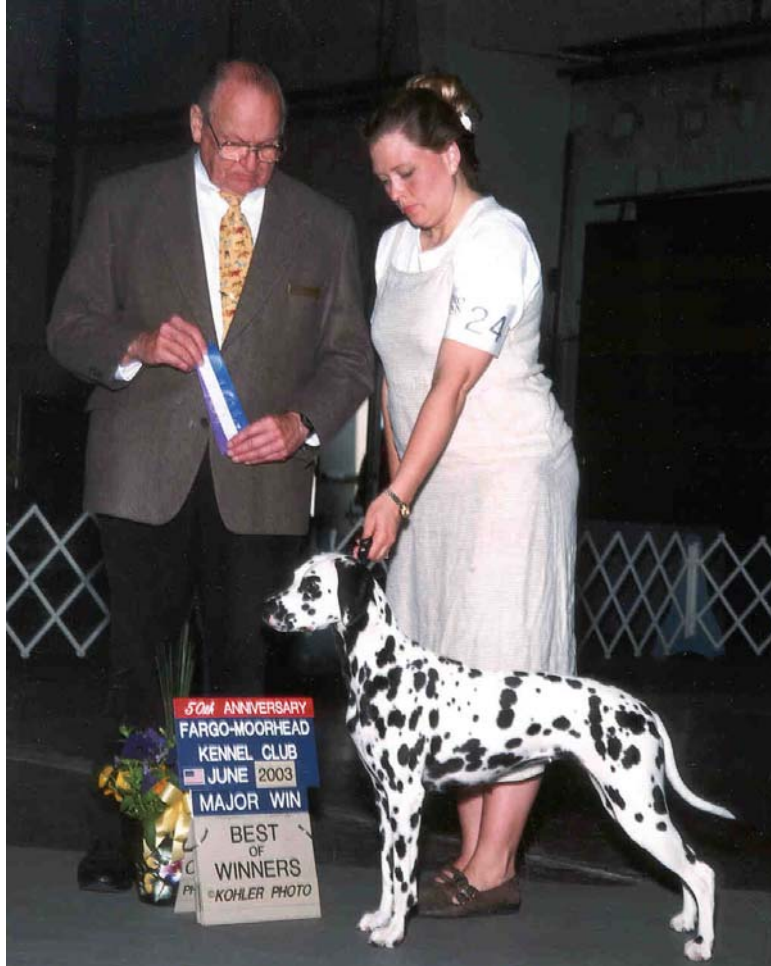
CH Vinland's Gesabelle O' Radagast (CH Firesprite Starcrest Vinland(L) x CH Radagast Vinland Gardn O' Eden)

Never out of the ribbons DCA 2002, 2 nd bred- by DCA 2003, a 5 point major, several major reserves and a 3 pointer to finish!